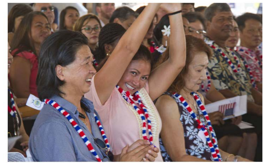
STAR-ADVERTISER / SEPT. 2014

The U.S. Citizenship and Immigration Services (USCIS) and the U.S. District Court, District of Hawaii welcomed 74 new U.S. citizens during a special Citizenship and Constitution Day naturalization ceremony. The U.S. Citizenship and Immigration Services is bringing many of its services to Honolulu online, starting Monday, and is encouraging applicants to take advantage of them, potentially saving time and money from making a trip to the field office at Waterfront Plaza.